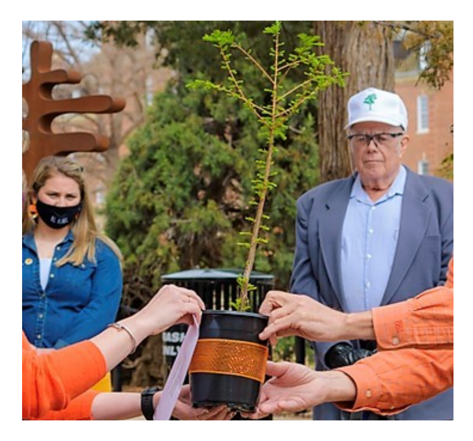
Above: One special feature this Arbor Day was gifting authentic Theta Pond Bald Cypress seedlings to select guests as a thank you for their contributions to our campus forest.